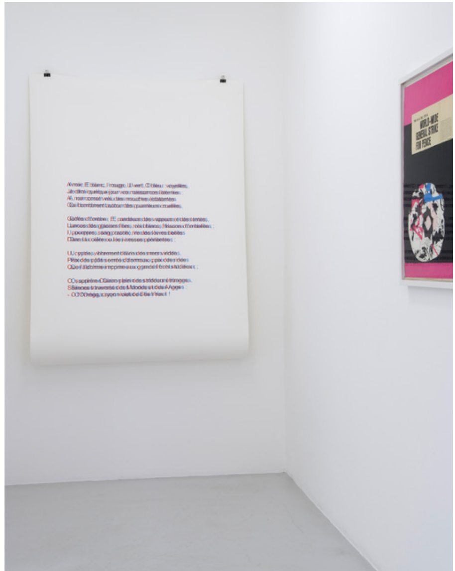
Exhibition views of "Arthur Rainbow", Air de Paris, Paris 2012.

Giancarlo Politi Editore - via Carlo Farini, 68 - 20159 Milano - P.IVA 09429200158 - Tel. 02.6887341 - Fax 02.66801290