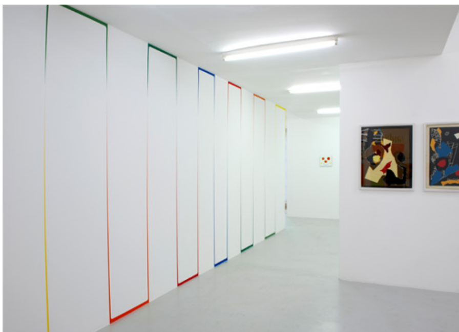
Exhibition views of "Arthur Rainbow", Air de Paris, Paris 2012.

This exhibition is finally an enjoyable mix between the "dignity of the decorative" (Matisse) and the Camp (Sontag) and its hallucinogenic dimension.