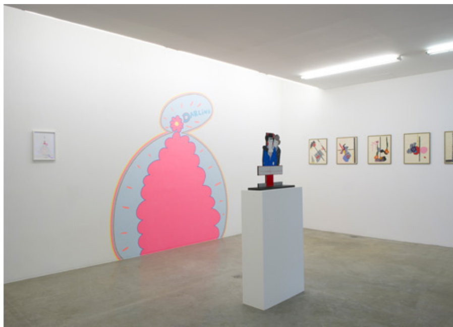
Exhibition views of "Arthur Rainbow", Air de Paris, Paris 2012. © Marc Domage. Courtesy Air de Paris.

Highjacking the name of the iconic French poet, the Arthur Rainbow group show at Air Paris is a display of works whose common feature is the liberating, transformative and ecstatic power of color. The playfulness and the cheerful colors of the works exhibited i as much embellishment as a less edifying reality (the impossibility of eternal youth, the for human liberty and pleasure, the unbearable lightness of being, etc.).