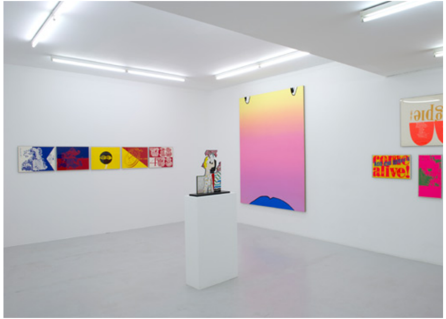
Exhibition views of "Arthur Rainbow", Air de Paris, Paris 2012.